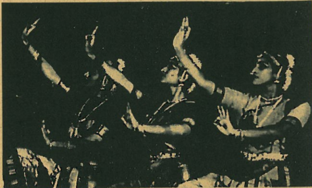
Kailash Dance Company

Fri Jan 6 1.00-2.00pm Suara Naga, the University of New England Gamelan - a traditional Indonesian orchestra. Canberra Centre - Free