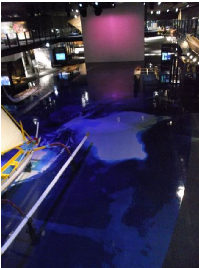
Ocean floor and film screen