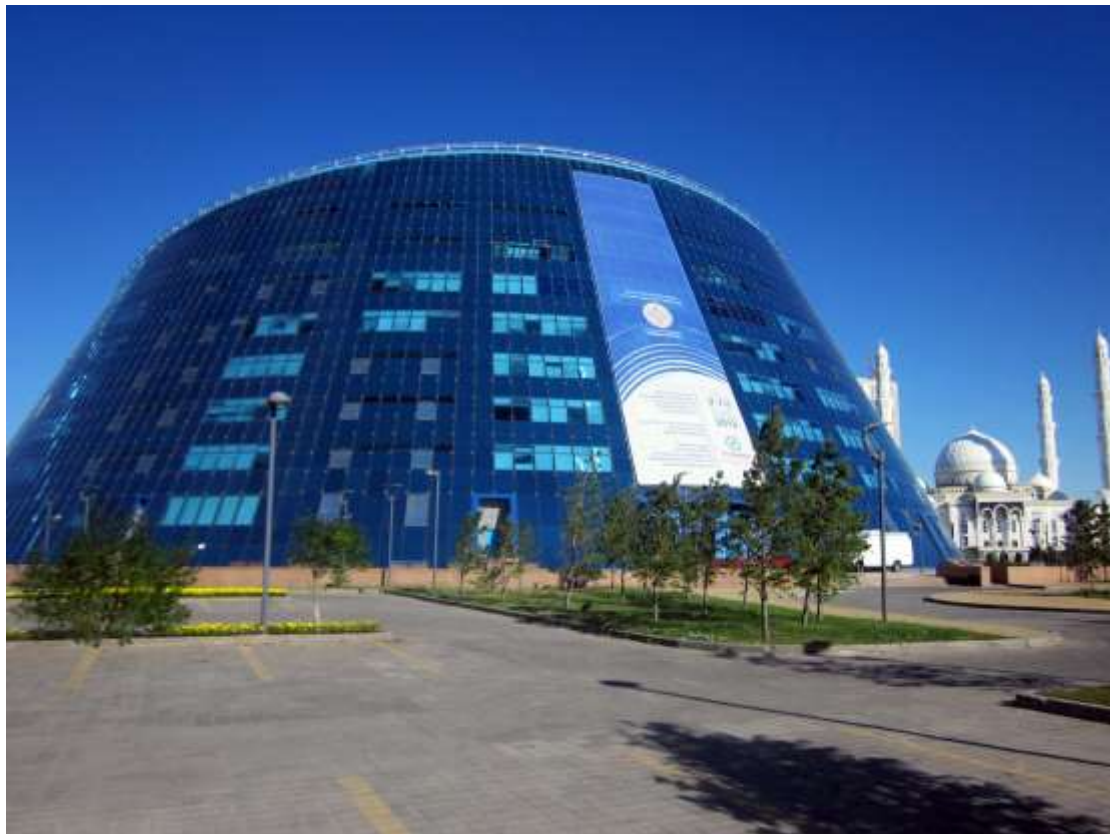
Photo 1: The Kazakh National University of Arts, host of the 43 rd ICTM World Conference

Hearty congratulations to all members who made it to Astana and thanks for your energy and enthusiasm!